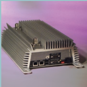
Nomadic Zone Point