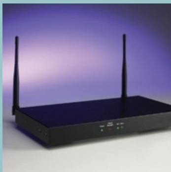
Indoor Zone Point

Canopy HotZone networks optimize wireless coverage with three types of Zone Points. Each module provides for maximizing application specific environments while maintaining unified access within the mesh network. Canopy HotZone is self-organizing and self-healing with each Zone Point module automatically recognized and integrated into the network as soon as it is installed and power is applied.