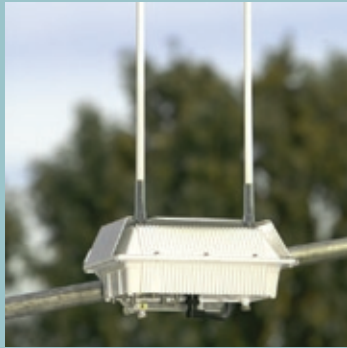
Outdoor Zone Point